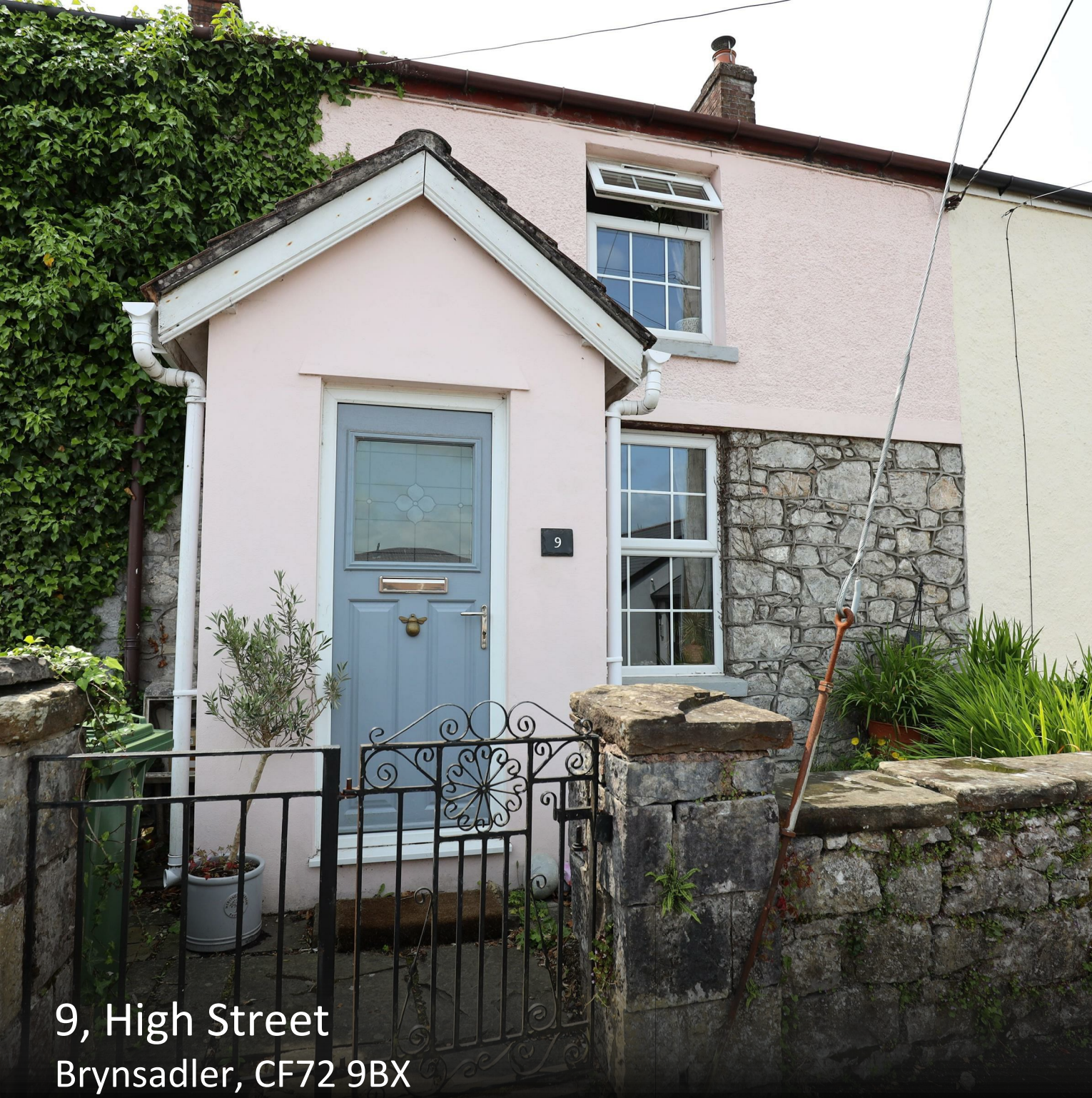
9, High Street Brynsadler, CF72 9BX